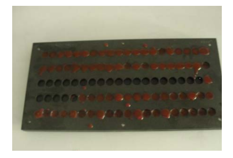
4. Let poured mixture settle at room temperature for 20 minutes.