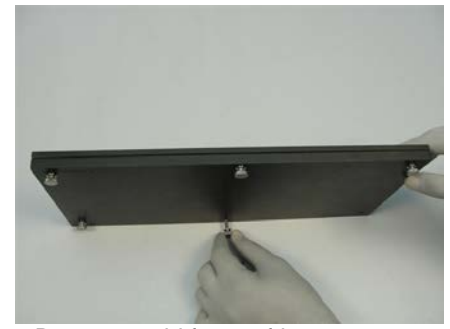
6. Remove mold from refrigerator. Unscrew all six screws to separate the two plates.

5. When mixture is slightly hard to the touch, scrape off excess using a rubber or silicone spatula. Place mold in refrigerator for 30 minutes to harden the lozenges.