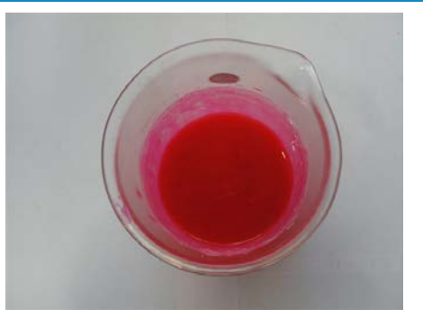
2. Add heat sensitive ingredients (color, flavor, active) and mix for 1-2 minutes or until uniform. Maintain heat so mixture flows.