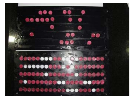
8. Place Top Plate beside the Bottom Plate. Remove any lozenges from the Bottom Plate using a rubber or silicone spatula. Do not use metal tools.