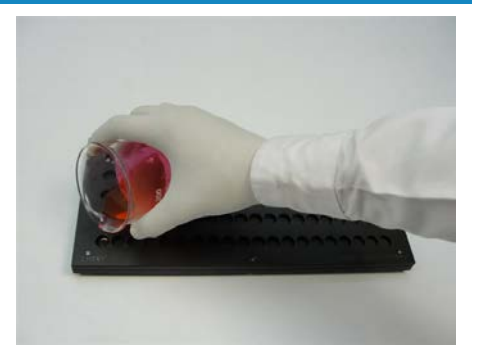
3. Pour melted mixture into mold cavities, overfilling cavities slightly.