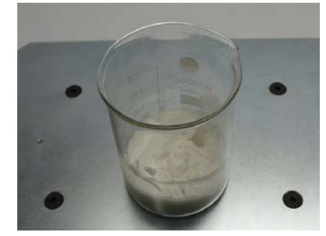
1. Melt required amount of base by heating on hot plate. Add required excipients and mix well. Prepare 5 to 10% extra by weight or volume.