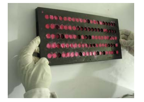
7. Lift the Top Plate to remove lozenges from the mold.