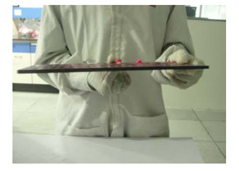
9. Using your finger press out any lozenges stuck inside the holes of the Top Plate.