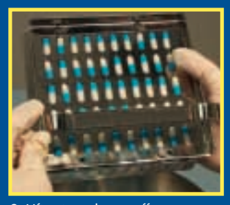
2. Lift gate and pour off excess capsules.